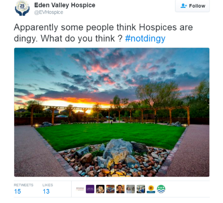
3. Sunset over the garden of the Eden Valley hospice

Given the omission of very sick, actively dying, and grieving people, viewers might have found it difficult to 'place' many of the images that were posted as a part of the #notdingy campaign without the accompanying 140 characters of text and hashtag (especially if the images did not include patients or medical staff and equipment). After all, this was just one more shared sunset or garden photograph that reflects the 'mundane ordinary aesthetics' of images posted on social media (Miller et al. 2016). Taken alone, then, the images posted as part of the #notdingy campaign would not have been able to interrupt viewers' negative notions of hospices or evoke alternate stories. However, posters encoded these generic images with particular meanings and symbolism through the accompanying 140 characters of text, which frequently asserted the images' ability to depict what hospices are 'really' like (Images 4). It was through this combination of generic images and textual truth claims that posters re-presented hospices as 'beautiful', 'helpful', 'supportive', 'wonderful', and 'excellent' places of care (Image 5). This re-presentation depended not so much on the formal and highly generic content of the images, but rather on their affective or emotional force (Vokes 2008) - that is, the images' ability to convey a general sense of emplaced warmth, brightness, and serenity, which posters then explicitly or implicitly connected to the provision of high quality, dignified care.