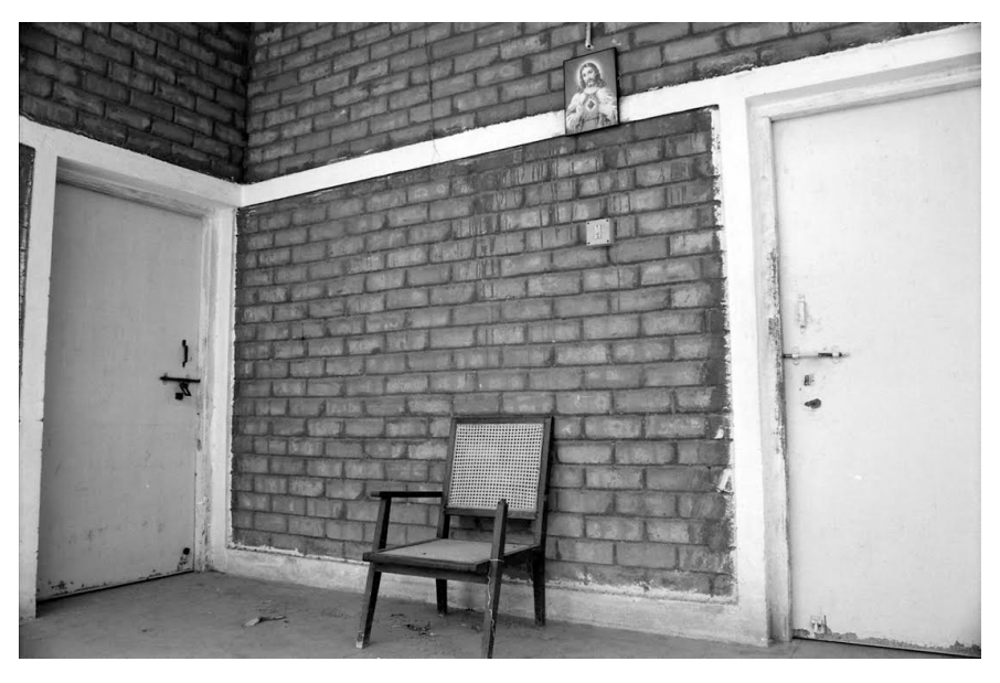
Figure 2. The porch outside the old kitchen, which also serves as a secondary reception area and a coffee station. It was inside one of these rooms that I would sit and chat with Father Paul over coffee.