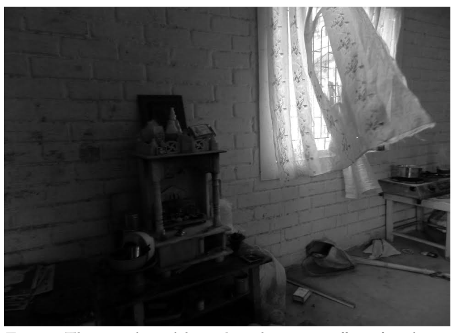
Figure 4. The room of one of the residents showing a small temple with images of Hindu gods and goddesses.

What is the social shape of this zone, what are its boundaries, and who are the players? At Philip AIDS Centre, there is one trained nurse for the eighteen patients, among whom