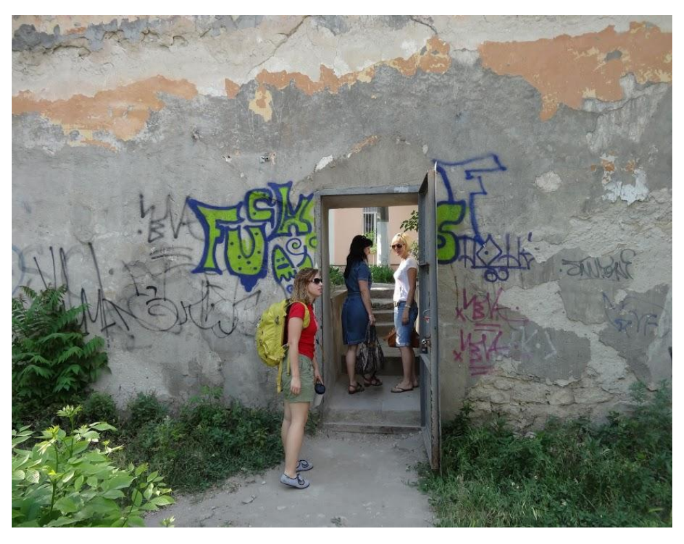
2. Entrance to the regional AIDS center in Mykolaiv