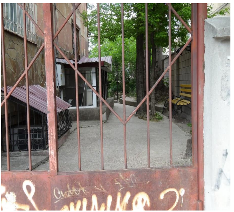
5. Locked entrance to HIV service agency in Crimea

HIV service agencies were open only during working hours. After hours, buildings were locked up (photograph 5), and services were delivered through mobile clinics or late-night pharmacies, resulting in an ever-changing map of services in a given city. And there was a constant threat that these daily closures could be made more permanent. Since the annexation by Russia of the Crimean Peninsula in 2014, some of the services provided by HIV service agencies, like opioid agonist treatment, are now illegal; others, like syringe distribution, are not supported. As political, economic, and social climates shift, the therapeutic landscapes previously nurtured in many of these spaces can no longer be tended, exposing the precarity of both the agency staff and clients, who are left without salaries and harm-reduction supplies.