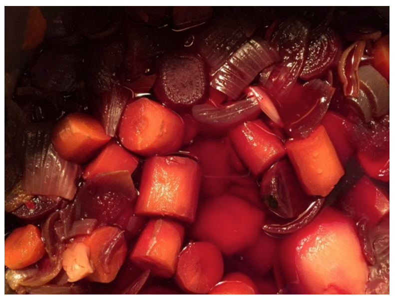
5. Food – Consciousness