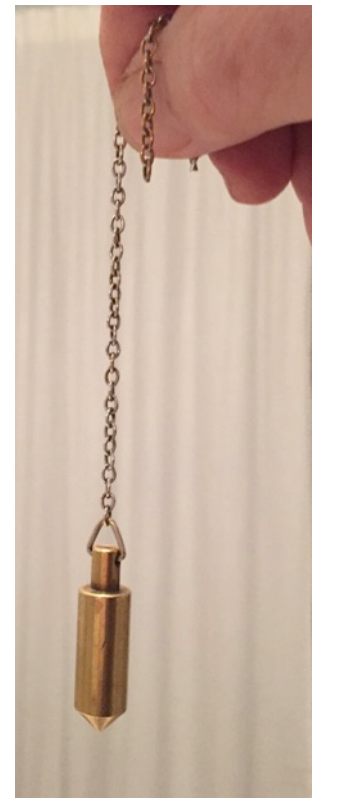
10. Pendulum – Challenge of intuition