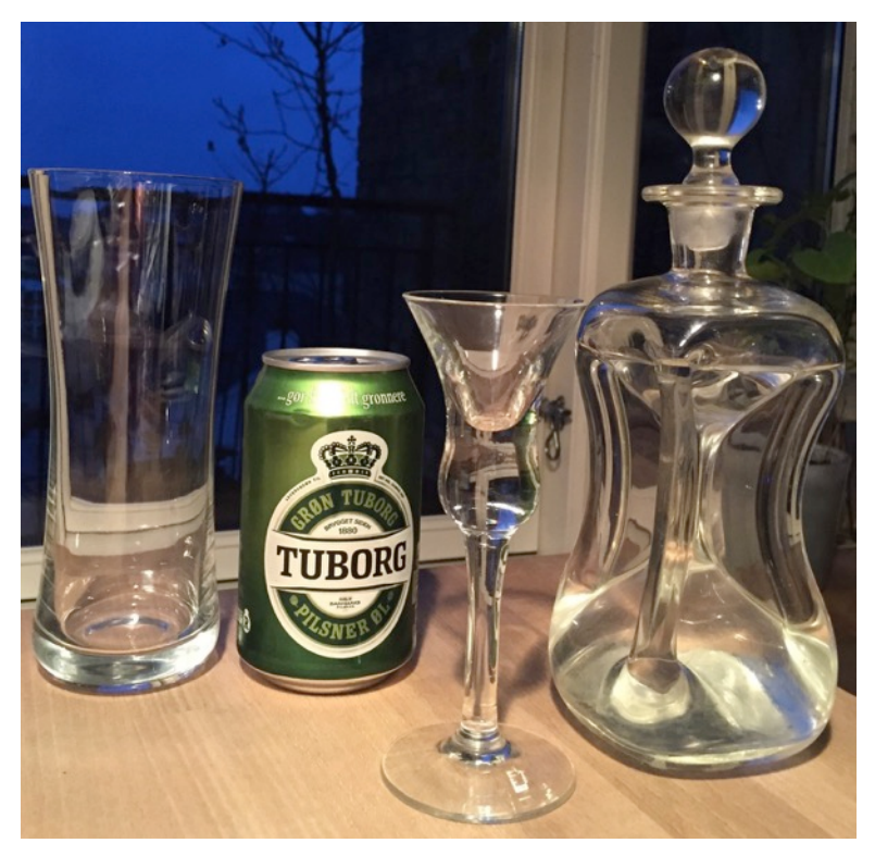
6. Alcohol – Health effect