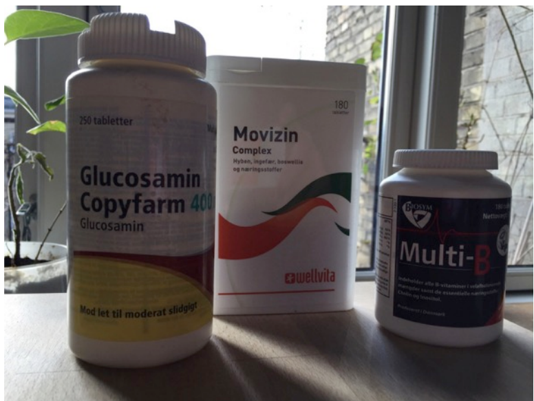
9. Medicines – Complementary