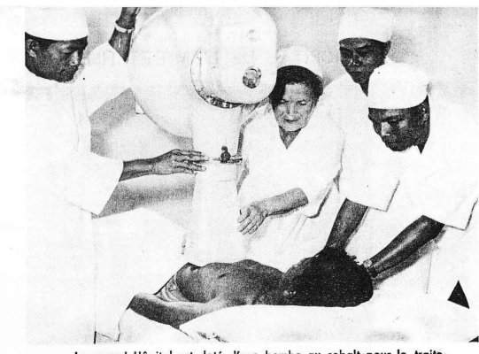
Le nouvel Hôpital est doté d'une bombe au cobalt pour le traitement des tumeurs malianes (ci-dessus).

In the Russian Hospital case, the agencies involved treated the high-activity source as an orphan source, but oral histories suggest it is cobalt-60 supplied by the Soviet Union to Russian Hospital in 1960 (see figure 3). Cobalt therapy, a gift of friendship, was the best treatment for cancer at that time. Russian Hospital workers believe radiological supplies were buried around the oncology building at the beginning or end of the Khmer Rouge period (1975–1979).