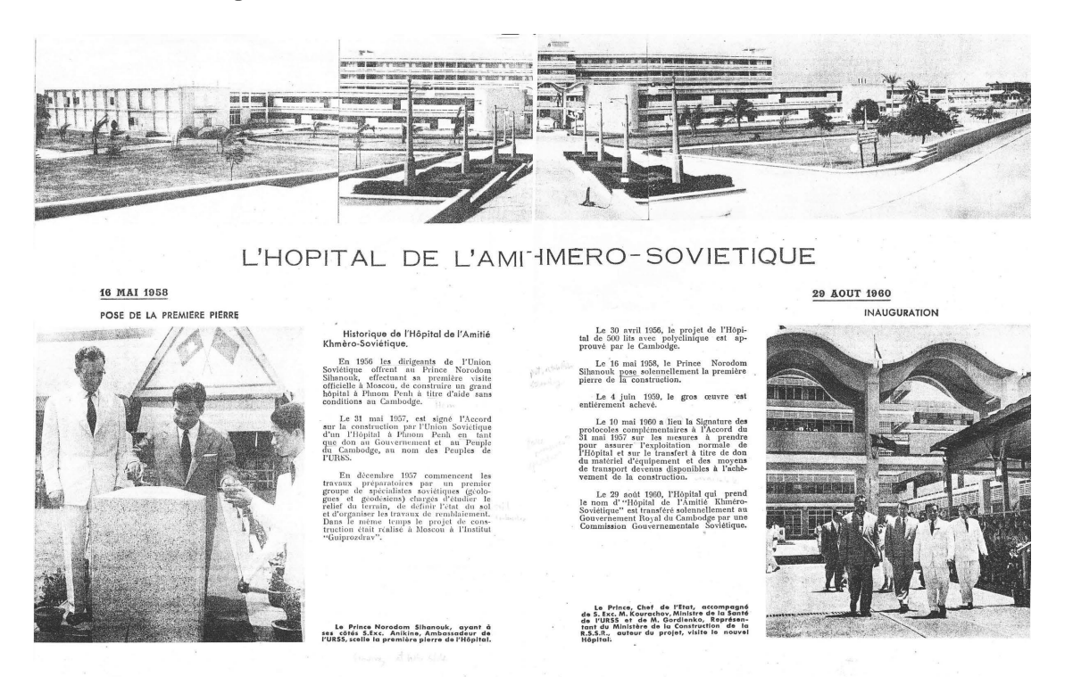
Figure 1. The Khmer-Soviet Friendship Hospital. From a feature on the opening in Cambodge d'Aujourd'hui , 1960. Courtesy of the Center for Khmer Studies Library, Siem Reap.

The grounds of the Khmer-Soviet Friendship Hospital teemed with ministers, foreign dignitaries, and hospital staff in white coats. Conversations were held in a combination of Khmer, Russian, and French. The August sun was blazing. Sihanouk, the prince and elected leader of post-independence Cambodia, was beaming with achievement: a brand-new hospital, the largest in Southeast Asia, a vaste cité médicale with cutting-edge equipment and training. Dancers waited to perform ballet in the opening ceremony, sweating under costumes and make-up, their gold headdresses glowing, the green and red silk of their costume radiating.