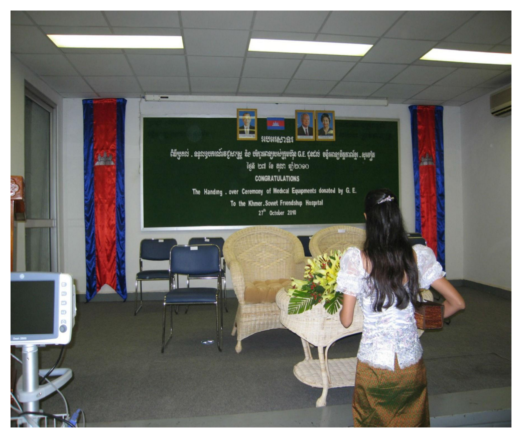
Figure 2. End of the commissioning ceremony

years ago. By the end of the year, he stated, GE will have worked at twenty-three hospitals: 'An x-ray machine for every hospital in Cambodia!' The technology would help dedicated staff at such a large hospital, he said. 'Please use the equipment to care for people. I want to unofficially rename this the "Khmer-GE Friendship Hospital". It was a joke, eliciting a ripple of chuckles from the room, but revealing nonetheless: GE replaces the USSR as the world's superpower.