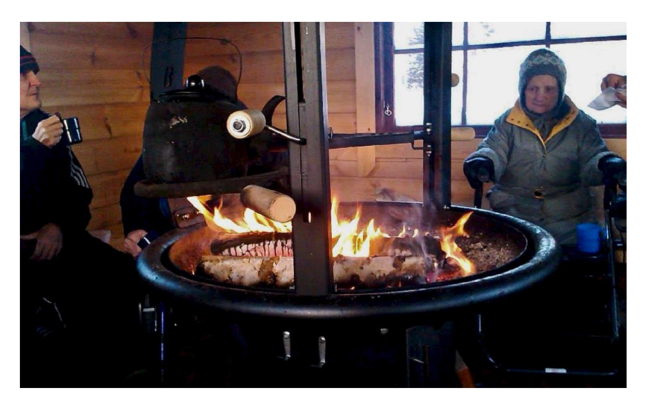
8. Smoking fish and drinking coffee with patients and carers in Muurutvirta, Northern Savonia Region, 2013.

Because of the season, green care activities included traditional winter pastimes; for example, in image 8 we see carers and patients from a dementia facility in a wooden cabin, together smoking fish. Data collection involved participating in the patients' activities, such as smoking fish, gardening, and eating meals together. Furthermore, structured interviews were conducted with staff at different locations.