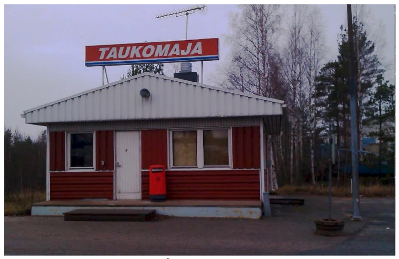
10. Truck stop motel complete with sauna in Änkilä, 2013.

the snow to the closest truck-stop motel, I arrived at my eventual accommodation for the evening (image 10).