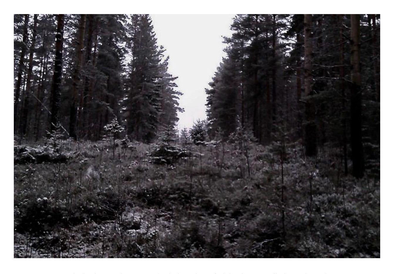
1. Forest near Oulu, in the Northern Ostrobothnia region of Finland, 2013.