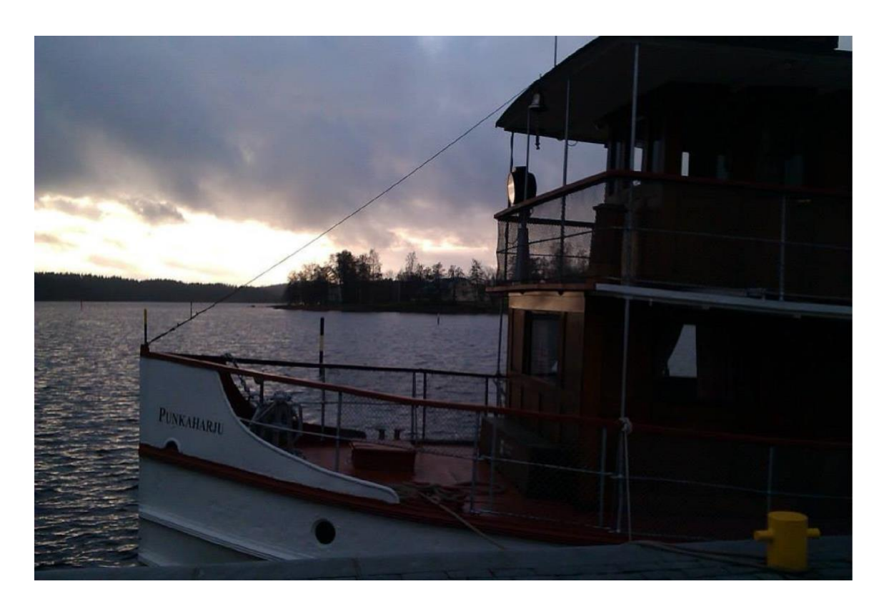
2. A boat on Kuussalmi Lake, Finland, 2013.

Perhaps ironically, my approach to ethnographic research draws heavily from the works of Pierre Bourdieu and his anthropological explorations of French colonial Algeria (Bourdieu and Schultheis 2012), where light levels and climate provided a different, but still complicated, set of methodological issues for visual methods.