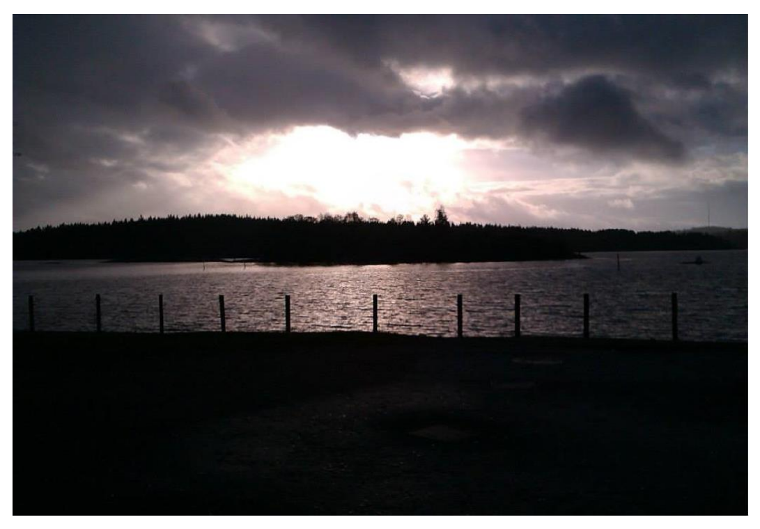
6. A lake near Savonlinna, 2013.