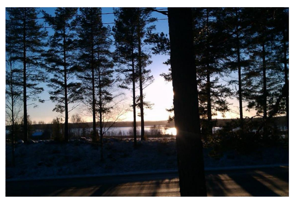
5. Forest at the edge of Vihti, in the Uusimaa region, 2013.

In addition to being taken in rural locations, a common feature in images 1 and 2 is their low light levels. This was because the majority of fieldwork occurred during the winter months. Conducting ethnographic research during this season (especially in outdoor conditions) creates particular challenges for visual methods and data capture in general. The longitude and the season mean that there is a semipermanent dusk or dawn, depending on the time of the day, as shown in images 6 and 7.