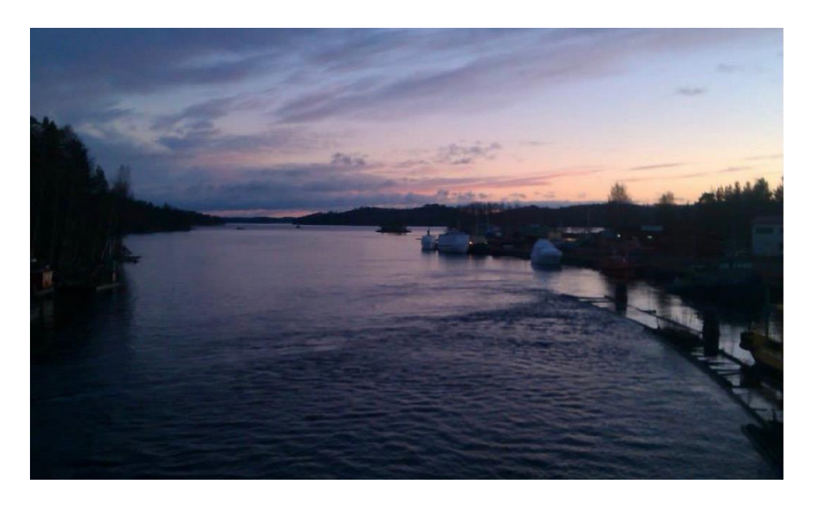
7. A bridge view of a shipyard in the Laitaatsilta Strait, 2013.