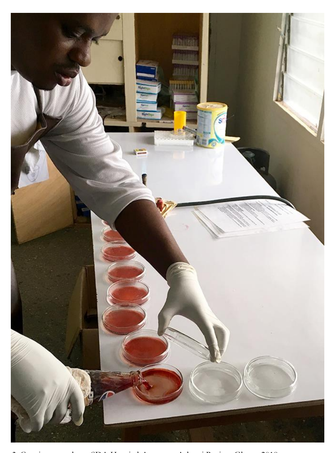
3. Creating agar plates, SDA Hospital-Asamang. Ashanti Region, Ghana, 2018.