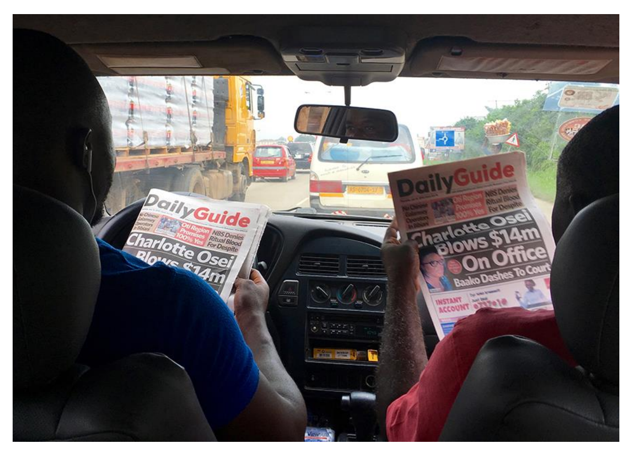
4. Reading the paper, Kumasi. Ashanti Region, Ghana, 2018.

Laboratory technicians in these areas show great dedication to their jobs. At the SDA's remote location, forty-five minutes to an hour off the main roads in Kumasi, it is difficult to maintain an adequate supply of agar plates. Knowing this, one of the few microbiologists at this hospital came in during his honeymoon to create blood agar plates from scratch. The agar dishes, while occasionally bought in well-funded hospitals, are prepared in the laboratory within Asamang's SDA hospital. The laboratory technicians perfect this task by using protein, salts, and agar mixes to create environments suitable for culturing bacteria. These mixes are placed in old glass Pepsi bottles and then autoclaved in a pressure cooker. The molten agar is then poured into plates on the microbiology lab table until each dish contains its allotted amount. This procedure is completed once every week or two, depending on need.