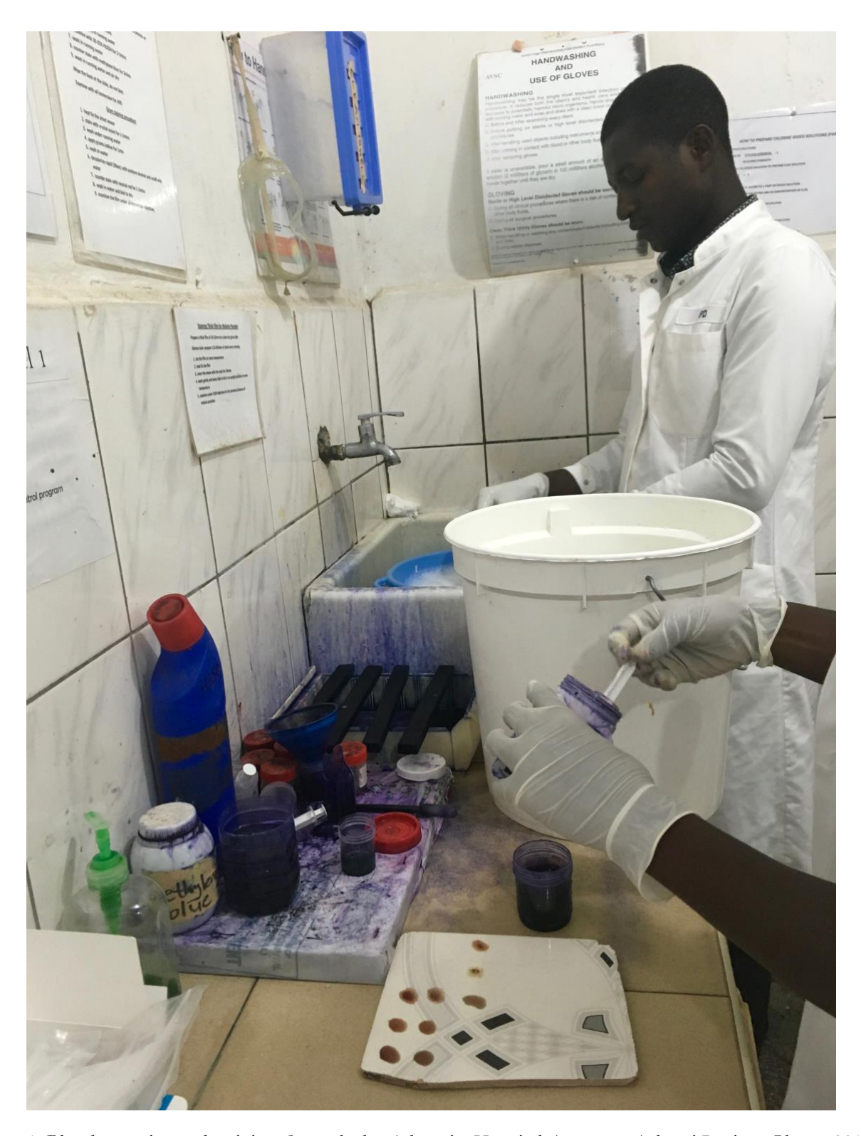
1. Blood grouping and staining, Seventh-day Adventist Hospital-Asamang. Ashanti Region, Ghana, 2018.