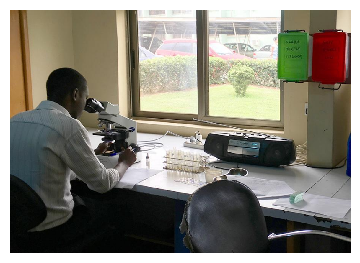
6. Analyzing a blood smear for malarial parasites, Kumasi South Hospital. Agogo-Kumasi, Ashanti Region, Ghana, 2018.

Per national protocol, potential blood donors must have a sample of their blood tested for viral pathogens, such as HIV. Outside the testing room on one ordinary weekday at the SDA hospital in Asamang, twenty patients are waiting to have their blood sampled for testing. Laboratory technicians receive on-site training in areas of need to ensure that they are able to efficiently complete the work. A recent university graduate (in the white coat), completing her national service in rural Ghana, studies the skill of sampling blood. The technician-in-training and her teacher will spend their entire day drawing samples from fifty to seventy patients who will need various forms of testing for their hospital stay or who wish to donate blood for a relative. The blood is tested for viral pathogens, and individuals are questioned to ascertain if they may have malaria, but they do not receive diagnostic testing for the blood-borne parasite, differing from some WHO recommendations. Clinicians at both hospitals believe that treating the disease based on the presentation of symptoms saves diagnostic tools, as a majority of the population has a built-up immunity to mild infection.