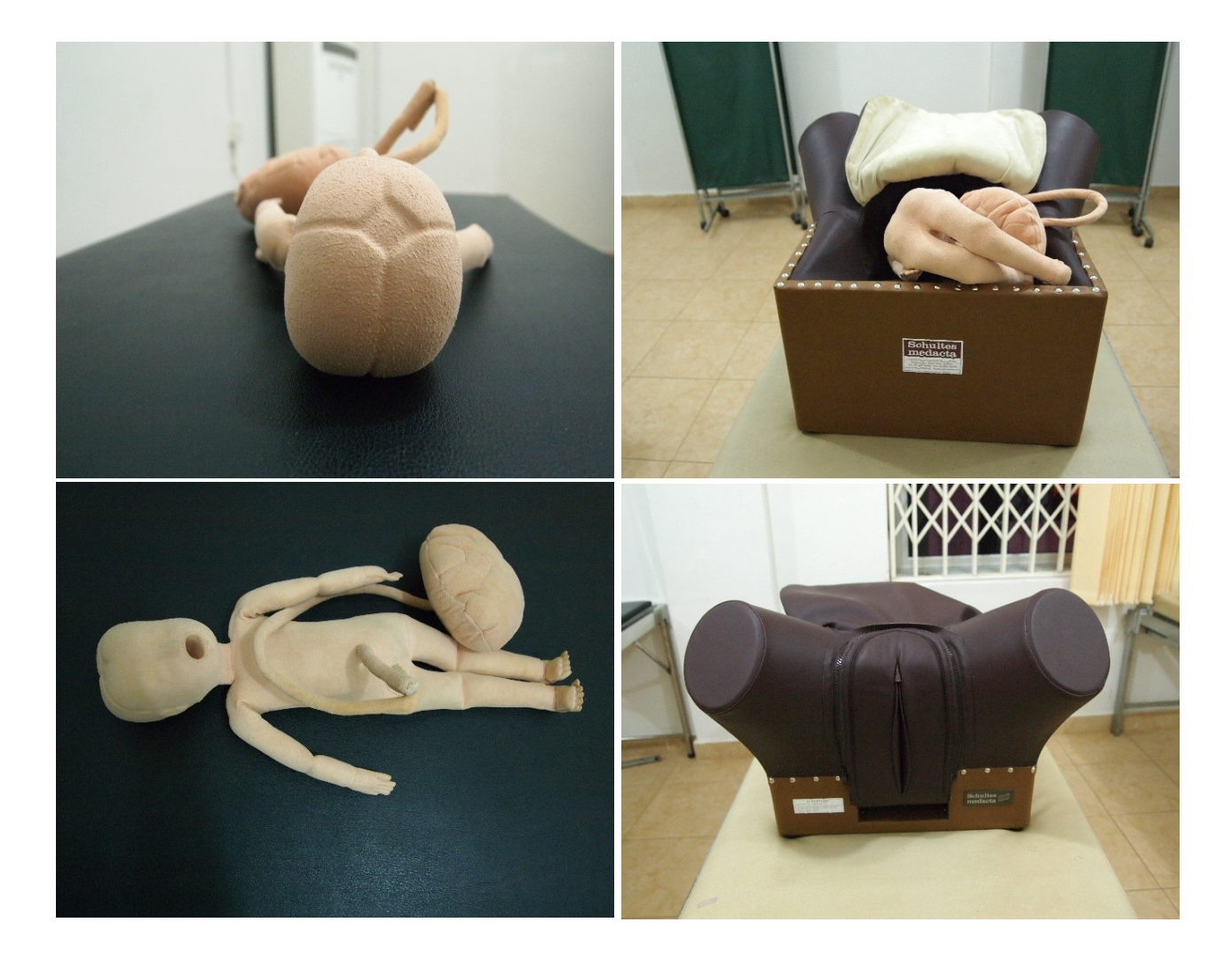
2. Schultes Medacta birthing manikin and foetal doll at UDS.