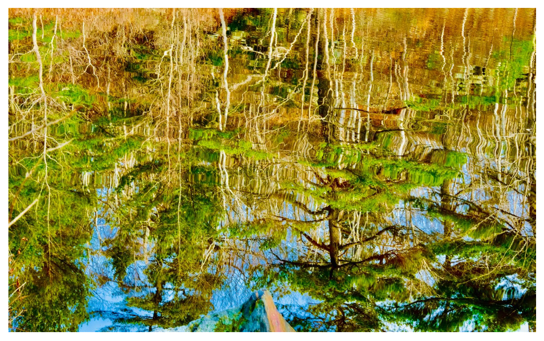
Figure 9. Healing Reflected Back to the Earth and Beyond.

Turning cancer into medicine includes telling stories—through images, through words—in ways that feel meaningful and connected to spirit, ways that reverberate from my ancestors and reflect back towards myself, my body, mind and spirit, my daughter, future generations, and back to the earth. The story told here, through words, through images and inner reflections, is my contribution to working towards finding harmony and healing on multiple levels.