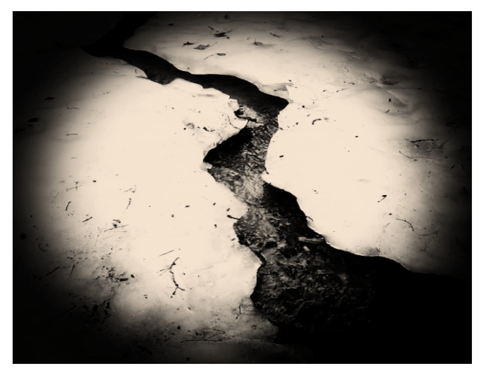
Figure 4. Earthly Bodies, Embodying Theory.

integral part of my healing work and storying my experience with cancer, as told on these pages.