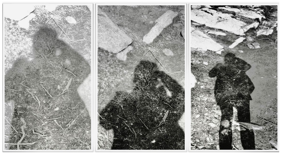
Figure 5. I am an extension of the earth.

The image I am an extension of the earth (Fig. 5) represents my embodied sense of vulnerability and connection to everything, all life forms. My cancer experience was a form of connecting to the 'pain of the land', the continued abuses it endures in the name of profit for the few. As Cree scholar Cash Ahenakew reminds us: