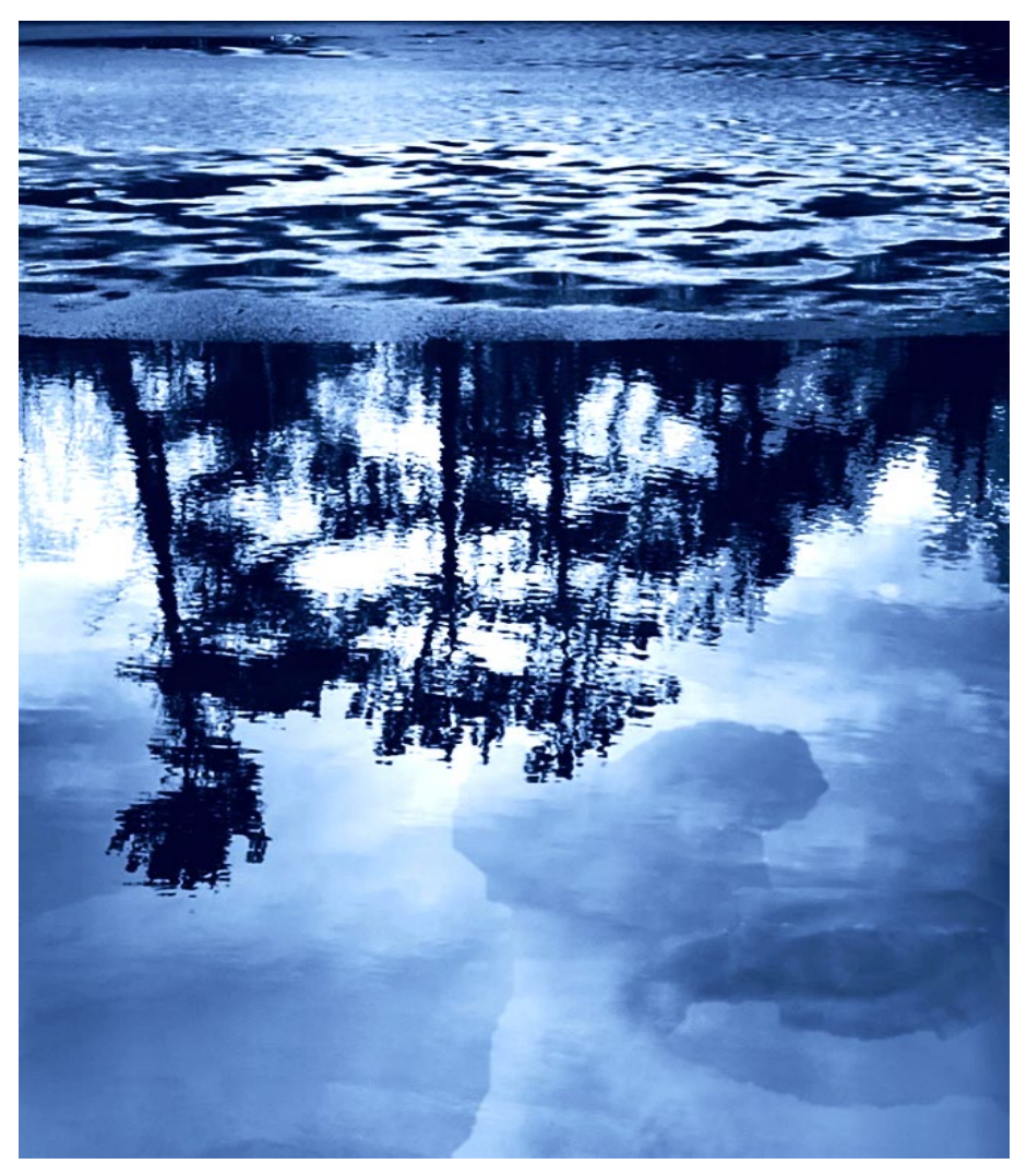
Figure 1. Embodied Vulnerability and Beginnings.

I am not ready to write. But I have to. I need to tell this story somehow. I need to create space by placing these images and words on a page as maybe they will resonate with others ... There are certain things I will not say here though ... they are mine (Excerpt from author's Cancer Journals, 2018).