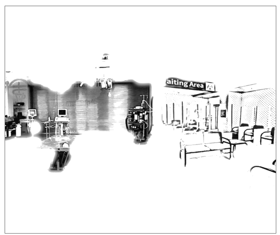
Figure 2. Where is the Sacred?

On the way to the surgery room I am alone, my family is left to wait in a separate room. Once I get to the operating room everything feels so cold, all shiny metal and more ultra-bright lights, the sounds in the room are echoey, and shrill, exaggerated by the starkness of the room and the sterility of everything in there. I am pricked in the arm to get an IV and a mask is put over my mouth, I can no longer speak, or move ... they tell me to start counting to 10 and the next thing I know I wake up groggy and confused in another room (Excerpt from author's Cancer Journals, 2018).