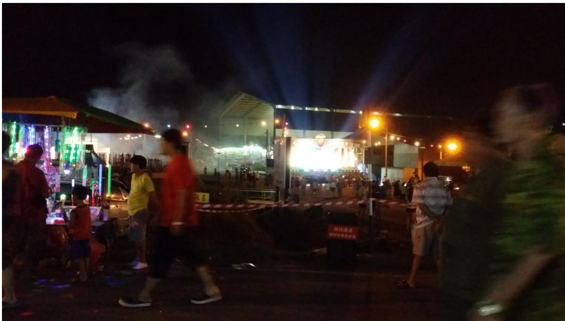
Figure 2. Late night visit to the market with a study participant as a field event.

all the people involved. Furthermore, different types of ICTs allow for different levels of synchronicity. Ahlin's experiences in constructing field events were based on webcam or phone interviews, which means that the field events were synchronous, bringing the ethnographer and the study participant together at the same time. In Li's case, however, the field events were co-created through smartphones and various social media platforms, which allowed for both synchronous and asynchronous field events. The asynchronous character of certain ICTs is convenient for communicating across various time zones. But asynchronous communication may also cause time lags for a variety of reasons, including technological breakdowns, workplace regulations, or personal conscientiousness, as Li's experience with Kevin showed. This can create uncertainty and thereby impair trust on both sides of the relationship (see also Pauleen and Yoong 2001).